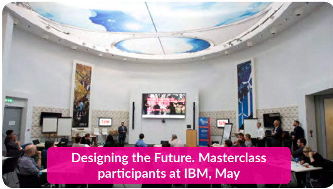
Designing the Future. Masterclass participants at IBM, May