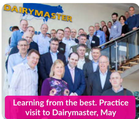
Learning from the best. Practice visit to DairyMaster, May

Visit www.irdg.ie to browse through our photo gallery.