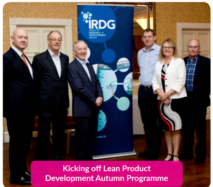
Kicking off Lean Product Development Autumn Programme