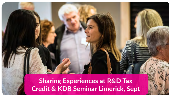
Sharing Experiences at R&D Tax Credit & KDB Seminar Limerick, Sept