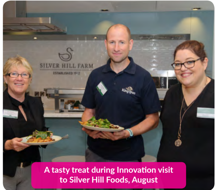
A tasty treat during Innovation visit to Silver Hill Foods, August