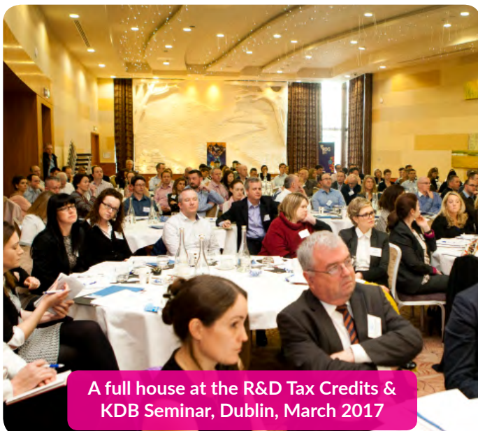
A full house at the R&D Tax Credits & KDB Seminar, Dublin, March 2017