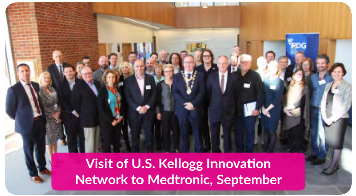
Visit of U.S. Kellogg Innovation Network to Medtronic, September