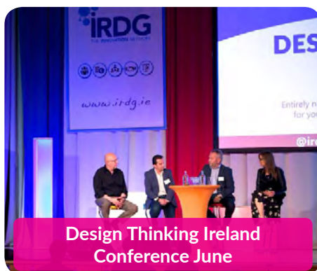
Design Thinking Ireland Conference June