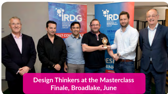
Design Thinkers at the Masterclass Finale, Broadlake, June