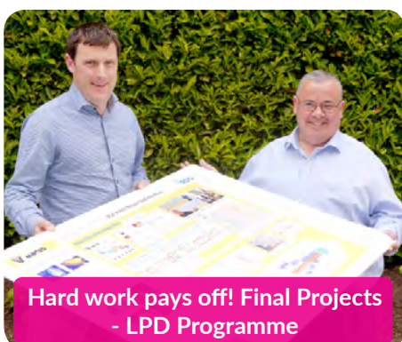
Hard work pays off! Final Projects - LPD Programme