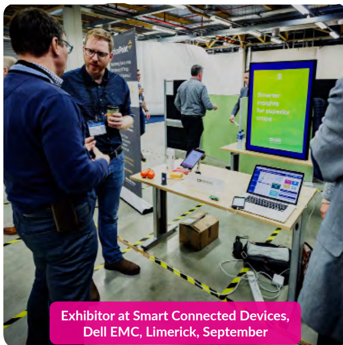
Exhibitor at Smart Connected Devices, Dell EMC, Limerick, September