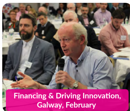
Financing & Driving Innovation, Galway, February