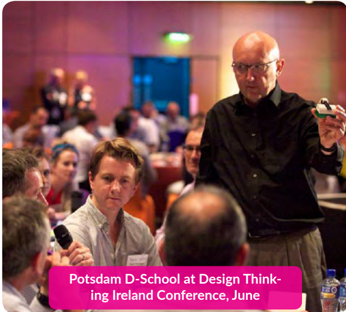
Potsdam D-School at Design Thinking Ireland Conference, June