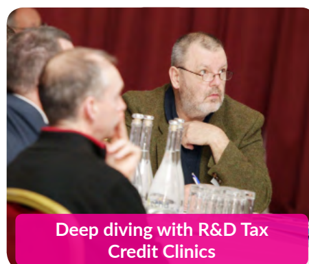
Deep diving with R&D Tax Credit Clinics