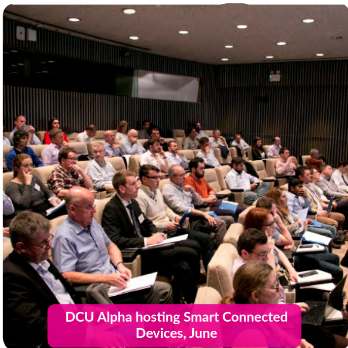
DCU Alpha hosting Smart Connected Devices, June